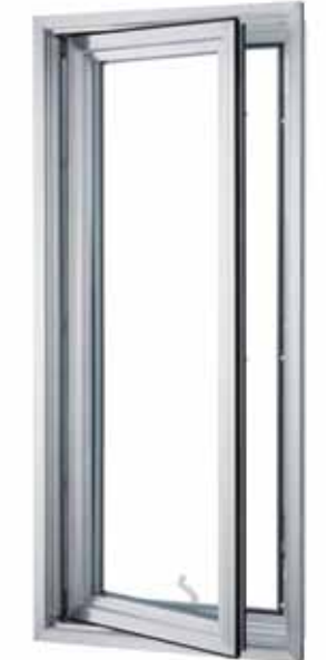
CASEMENT AND AWNING WINDOWS