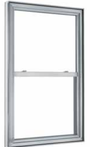
SINGLE-HUNG AND SINGLE-SLIDER WINDOWS